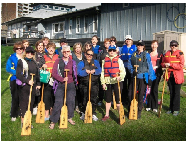
Dragonboaters in full gear

The full Interest Groups schedule is in the September newsletter as well as on the web page at